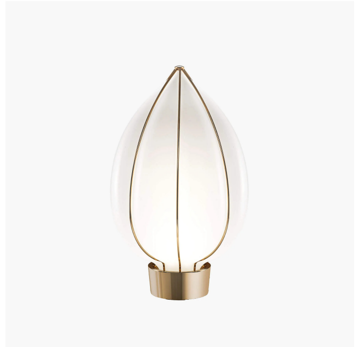
Table lamp made using the cage blowing technique. Light gold metal cage and white glass diffuser.