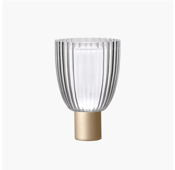
Table lamp in carved crystal with internal diffuser in blown and satin glass. Metal base with matt champagne, matt bronze or matt black finish.